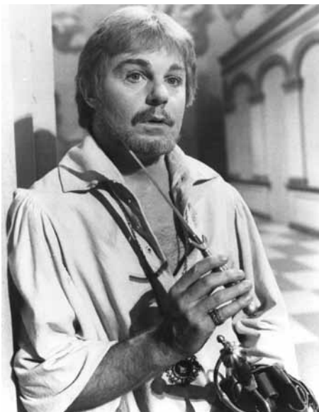
Derek Jacobi, Hamlet, PBS TV movie (based on the Prospect Theater Company production), 1980.