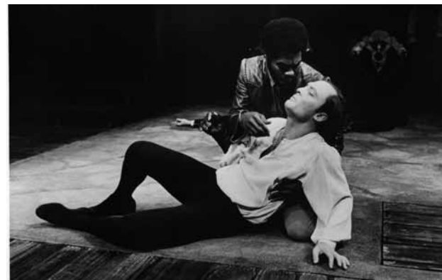
Stacy Keach as Hamlet, Hamlet, 1974, Center Theatre Group/Mark Taper Forum.

When we meet Hamlet in that opening scene, a lot has happened. His father has died, his mother has married his uncle, and he's bitter and angry about that. That's what we know. The quality of behavior has to go beyond that color. It's how you deal with that . Are there glimpses of madness in the scene? Is there laughter? You start thinking—hmmm, laughter. Should I make this gesture (or phrasing) or that?