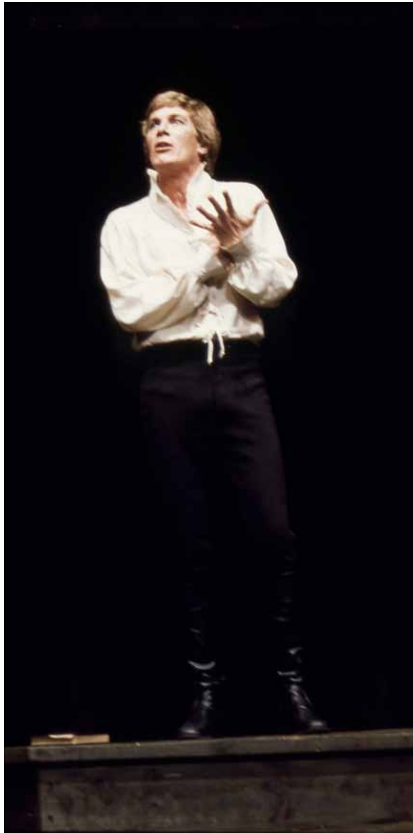
Nicholas Pennell as Hamlet, Hamlet , 1976, Stratford Shakespeare Festival.